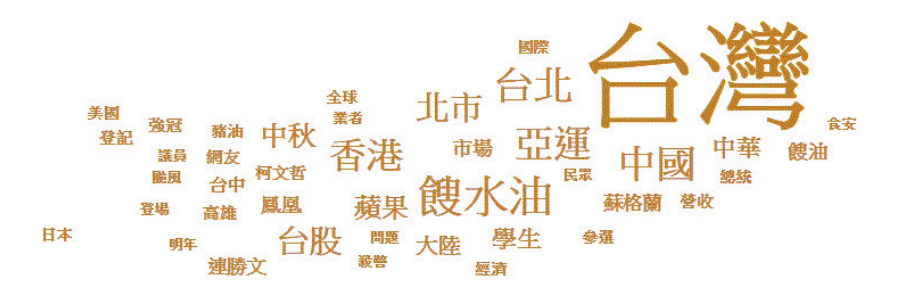
Figure 2. The 2016 February status is generated by the TF method.

In Figure 2, we observe that the words related to the Umbrella Revolution, such as "Mainland China"(大陸), "Hong Kong"(香港) and "Student"(學生), are in the KC generated by the TF method. However, the related information about the event is not observed in the KC. On the other hand, the KC generated by the KEF_{hierachy} has richer information. For example, the Hong Kong protest caused a severe slump in Hong Kong tourism(香港旅遊業). Sen-Hong Yang (楊憲宏) who is a journalist and human rights activist made many comments about the protest. Through the KC of the KEF_{hierachy} , users can have a comprehensive understanding about the most interested issue of 2014 September status.