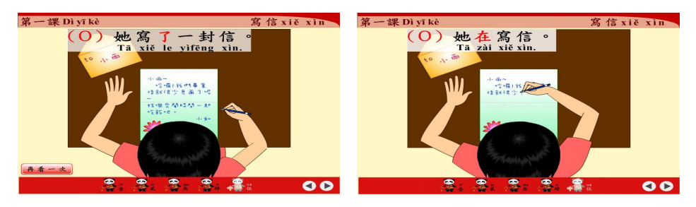
Figure 3. An example of animation in the interactive multimedia program

Comparing to the interactive multimedia program, the computer-based grammar program<sup>13</sup> was also digitalized based on our designed CFL program. The difference between them lies in the presentation of semantics of the target sentences. In the interactive multimedia program, the semantics of target sentences were presented with animation as Figure 3. On the contrary, the computer-based grammar program expressed the meaning of the target sentences by English translation as Figure 4.