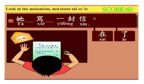
Figure 2. An example of the exercise in the interactive multimedia program.

the target sentences of the program and they were designed based on two content objectives: (i) Users are able to comprehend the interpretation of the interaction of zai , zhe , and le with their compatible events. (ii) Users are able to know the collocation of these three aspect markers with events. For example, through doing the exercise 'Look at the animation and move zai and le ', the users are expected to comprehend the semantics and the syntactic structure of zai and le , shown as Figure 2.