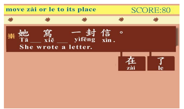
Figure 5. An example of the exercise in the grammar program

computer-based grammar program. For example, 'She is writing letter' for Ta zai xie xin and 'She wrote a letter' for Ta xie le yifeng xin . Moreover, the computer-based grammar program offered the interactive exercise as the interactive multimedia program did. The interactive exercises in the computer-based grammar program are different from those in the interactive multimedia program in the presentation of the semantics of the target test items. As the following Figure 5, the meaning of the target test item was expressed by their English corresponding sentences.